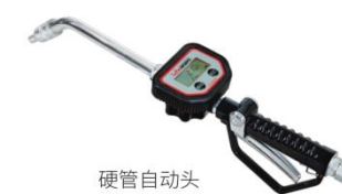
LW014: 18123523 digital display gun