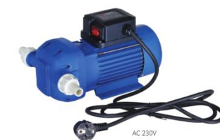
LW016 : 17350250 220v