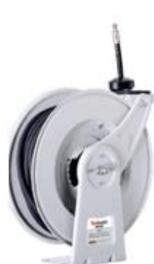
LW012: HR860 for all