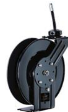
LW011:HR809 For all