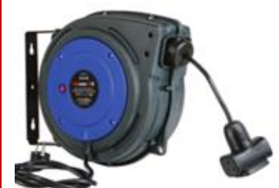
LW008:CR631 1.5mm² 10m