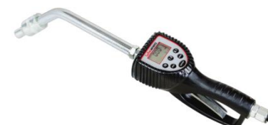
LW015: FN105.03 preset digital display gun