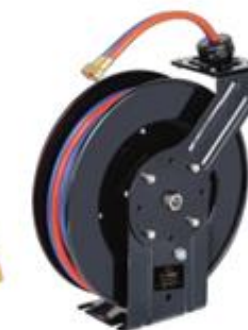
LW010: WH809 10m 8mm+6mm