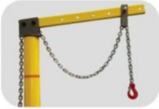
Pulling Tower with 10T capacity