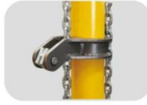
Guide Ring, make the pulling more easily